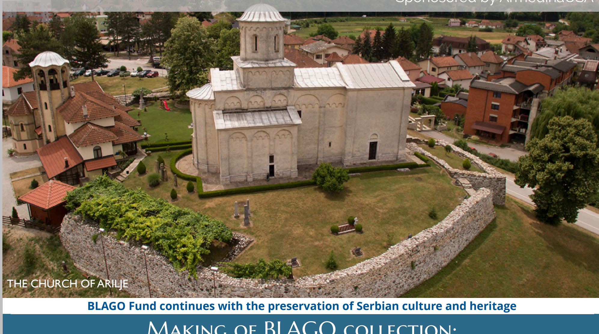
THE CHURCH OF ARILJE

BLAGO Fund continues with the preservation of Serbian culture and heritage